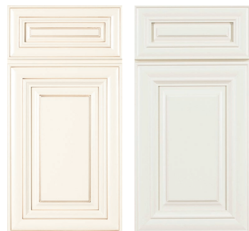
Princeton Creamy White Princeton Off White