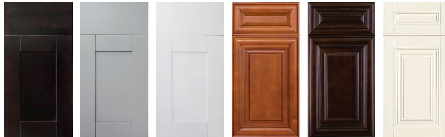
Anchester Espresso Anchester Gray Anchester White Cambridge Edinburgh Oxford